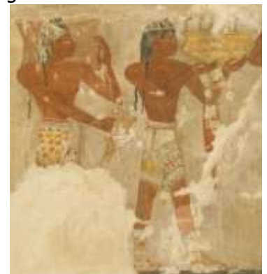
Cretan offering bearers in tomb TT100

1: Tomb TT100 belongs to Rekhmire and contains some of the most interesting of all Egyptian tomb paintings