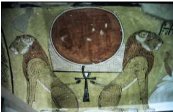
The sun rises in its horizon over the backs of the aker lions of past and future. Tomb of Anherkhau

We look forward to giving as many of our Members as possible the opportunity to voice their views on the Society's future.