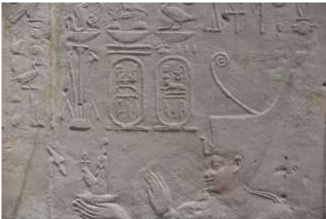
Ptolemy III as Guardian of Maat, Leiden