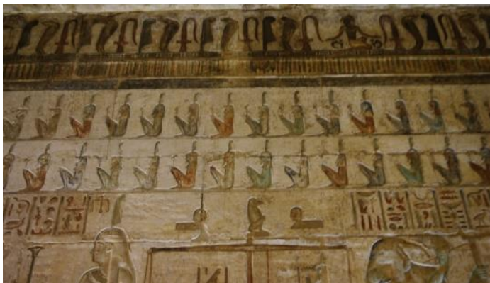
Some of the Forty-Two assessor deities, from the Temple of Hathor at Deir el-Medina.

Aidan stressed the differences and similarities between the cult temples of Karnak and Luxor and the mortuary temples, which he called memorial temples, of the west bank. He treated the monuments in chronological order showing how they were partially or wholly demolished, extended, remodelled and refurbished at regular intervals as each new monarch placed his stamp on them. The illustrations were well-chosen, often giving insight into the less well-frequented or inaccessible corners of the temples. This was one of those days when the time flew by all too quickly and we were left wanting more.