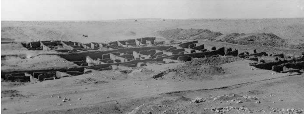
Amarna workmen's village, 1922