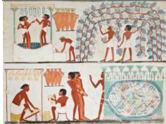
Nina's painting of a scene from the tomb of Nakht

recorded some of the most iconic tomb paintings of ancient Egypt.